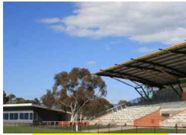
“Hawks Nest 2017”